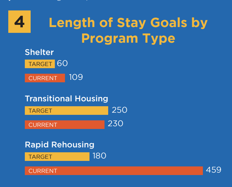
Figure 4 shows Framework goals for length of stay by program type and the value over a 12-month period ending June 1, 2023.

Average shelter and transitional housing lengths of stay have declined over the past six months while rapid rehousing lengths have increased slightly. The average transitional housing length of stay is below the Framework goal. However, declines in lengths of stay only help with the overall goal of reducing homelessness if declines coincide with increased programs exit to permanent housing.