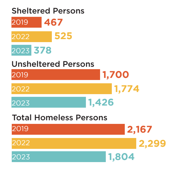
Figure 1 shows how the number of homeless persons changed over time in three PIT Counts (2019, 2022 and 2023). The number of sheltered individuals is lowest in 2023 due to the closure of COVID-related shelters in 2022.